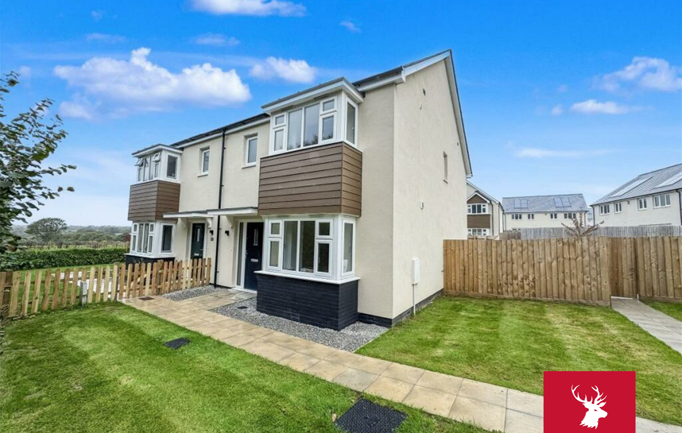
Plot 24, The Shearings